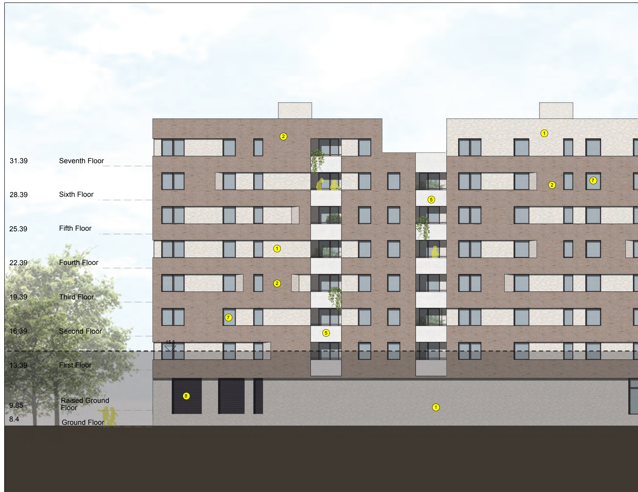
East Elevation scale 1:200@A3